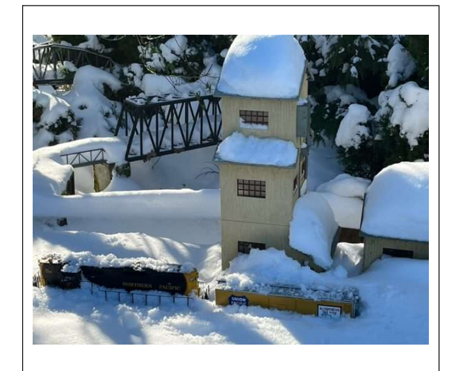
Fred & Bernice Konkell

We welcome anyone with an interest in model railroading!